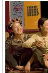
In Chinese Village, Gold Evokes Anotl

Home | World | U.S. | N.Y./Region | Business | Technology | Science | Health | Sports | Opinion | Arts | Style | Travel | Jobs | Real Estate | Automobiles | Bac