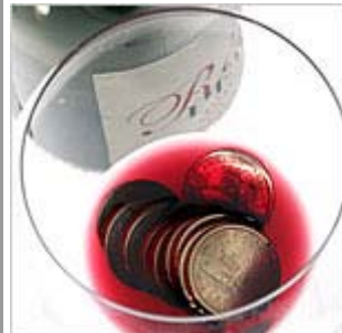
Interactive Feature: Wines for $10 and Under