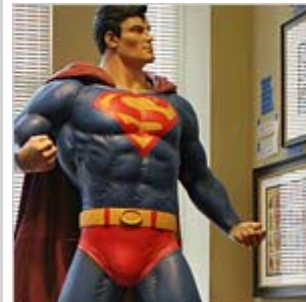
Museum of Steel: Cartoon History in a Single Bound