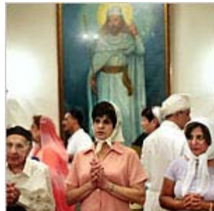
Zoroastrians, Dwindling, Keep the Faith